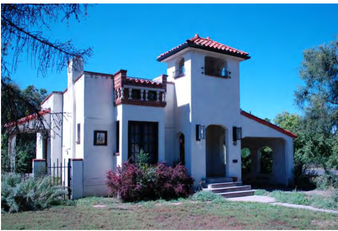
The Italian Villa house today.